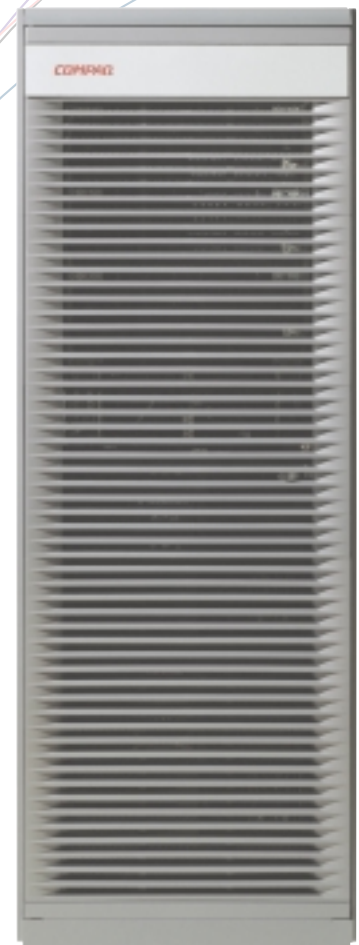
▲ AlphaServer ES40

“We are very enthusiastic about the increased scalability and significantly decreased management costs that are a part of the V5 release. Not only do we see a substantial performance improvement, we do so with only one third of the floor space and with a dramatic reduction in complexity and an associated increase in manageability.”