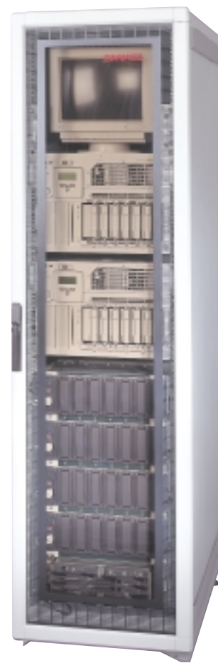
▲ StorageWorks RAID Array

That's because TruCluster Server V5 is a true single image system. Members of the cluster operate as a single system, transparently sharing resources, including data storage and clusterwide file systems — yet, at the same time, individual nodes can boot or shut down independently, without disrupting the cluster.